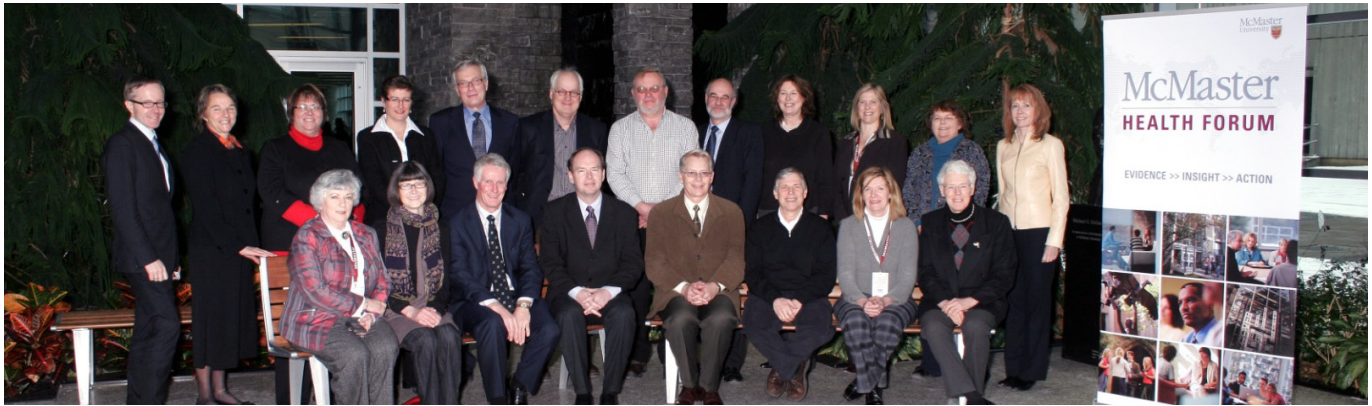
Participants gather during a McMaster Health Forum event on 8 January 2010