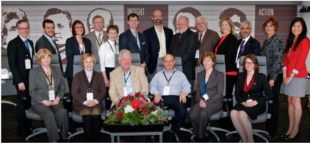
Participants representing a broad range of health organizations, patient and professional groups, researchers and other stakeholders gather during a McMaster Health Forum event on April 11, 2011